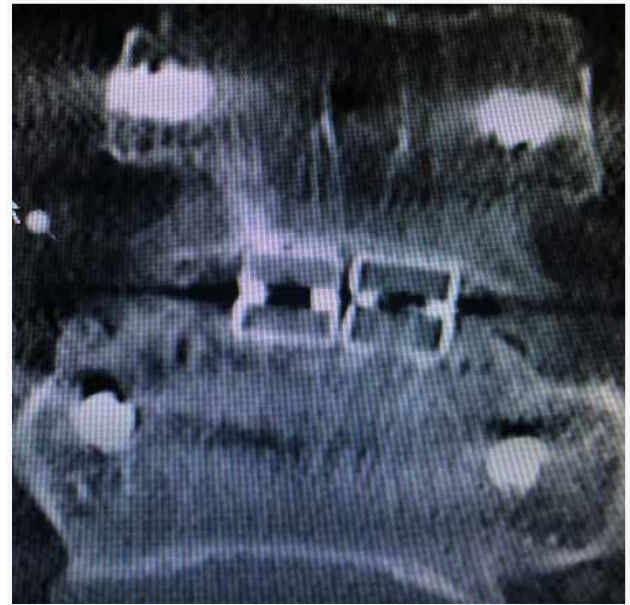
Figure 3. Frontal cut at the posterior border of the cage. Clear ingrowth of bone on the titanium layer of the cage.

According to the provided CT images, the TiPEEK cages retain a significant potential to increase fusion rates with enhanced bony fusion through the cage and also onto a Titanium film surface.