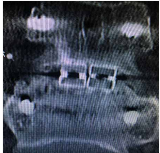
Figure 3. Frontal cut at the posterior border of the cage. Clear ingrowth of bone on the titanium layer of the cage.

According to the provided CT images, the TiPEEK cages retain a significant potential to increase fusion rates with enhanced bony fusion through the cage and also onto a Titanium film surface.