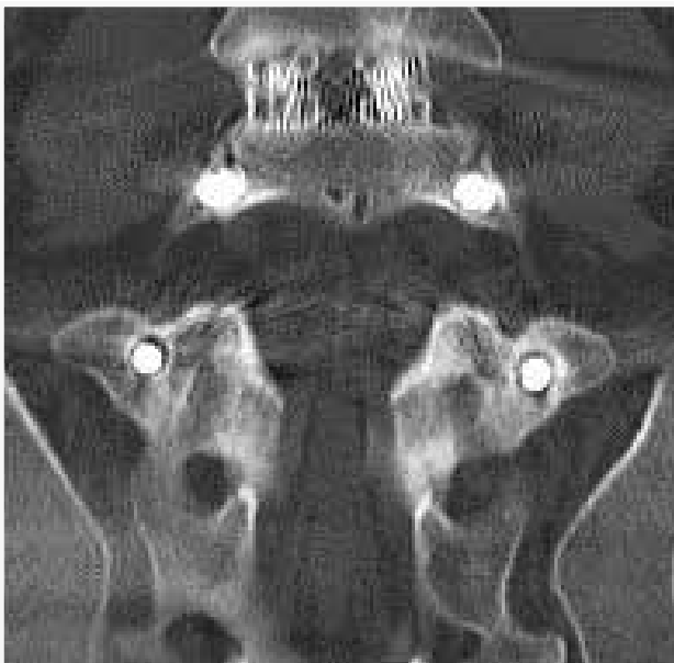
Figure 1. Evidence of bony fusion in a post-op CT scan

Radiological findings on CT scans suggested that bone formation had been established directly to the titanium layer in all treated patients (Figure 1).